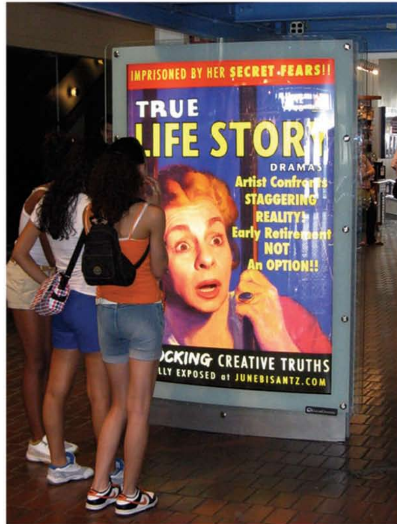
Left, door clings, above back-lit advertising kiosk South Street Seaport Pier 17 Mall, NYC